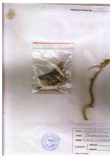
Figure No. 1: The aerial stem of Tinispora cordifolia (Authenticated)